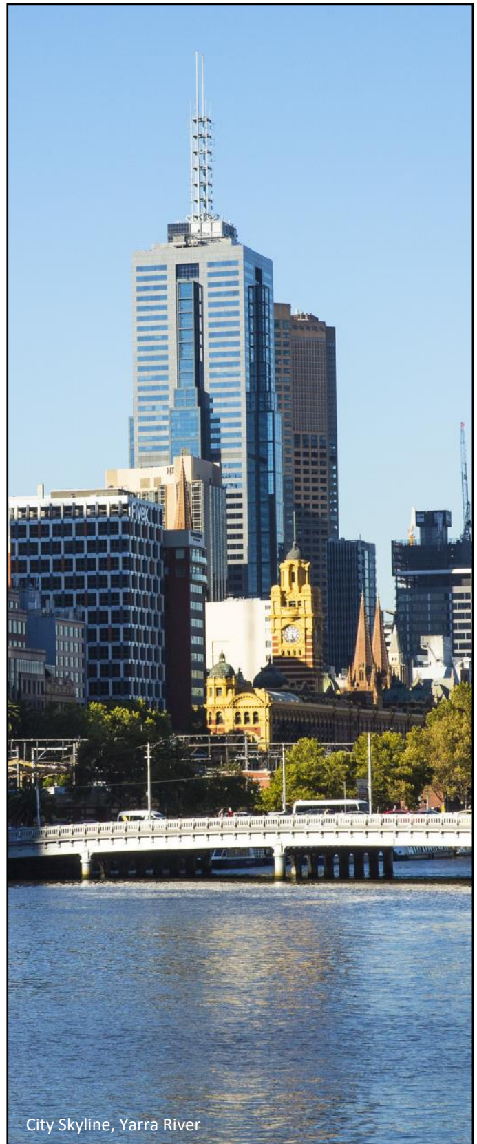
City Skyline, Yarra River